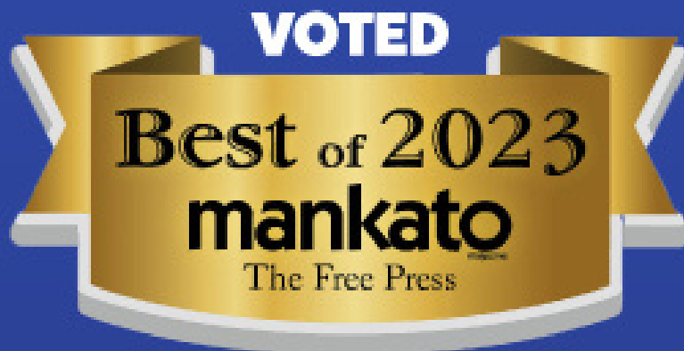
Mankato Chevrolet 1815 E Madison Avenue

Best Auto Dealership (New) Best Auto Service Center