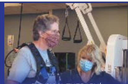
PHYSICAL THERAPY/ OCCUPATIONAL THERAPY